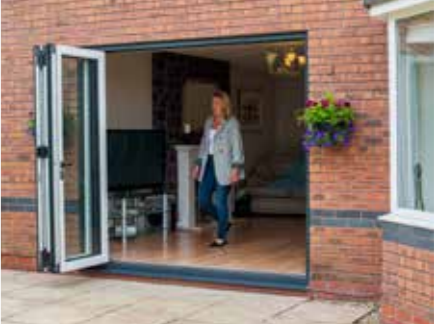
The Imagine Bi-Fold Door makes an attractive alternative to a traditional sliding patio door; completely opening your home up to the garden or patio.